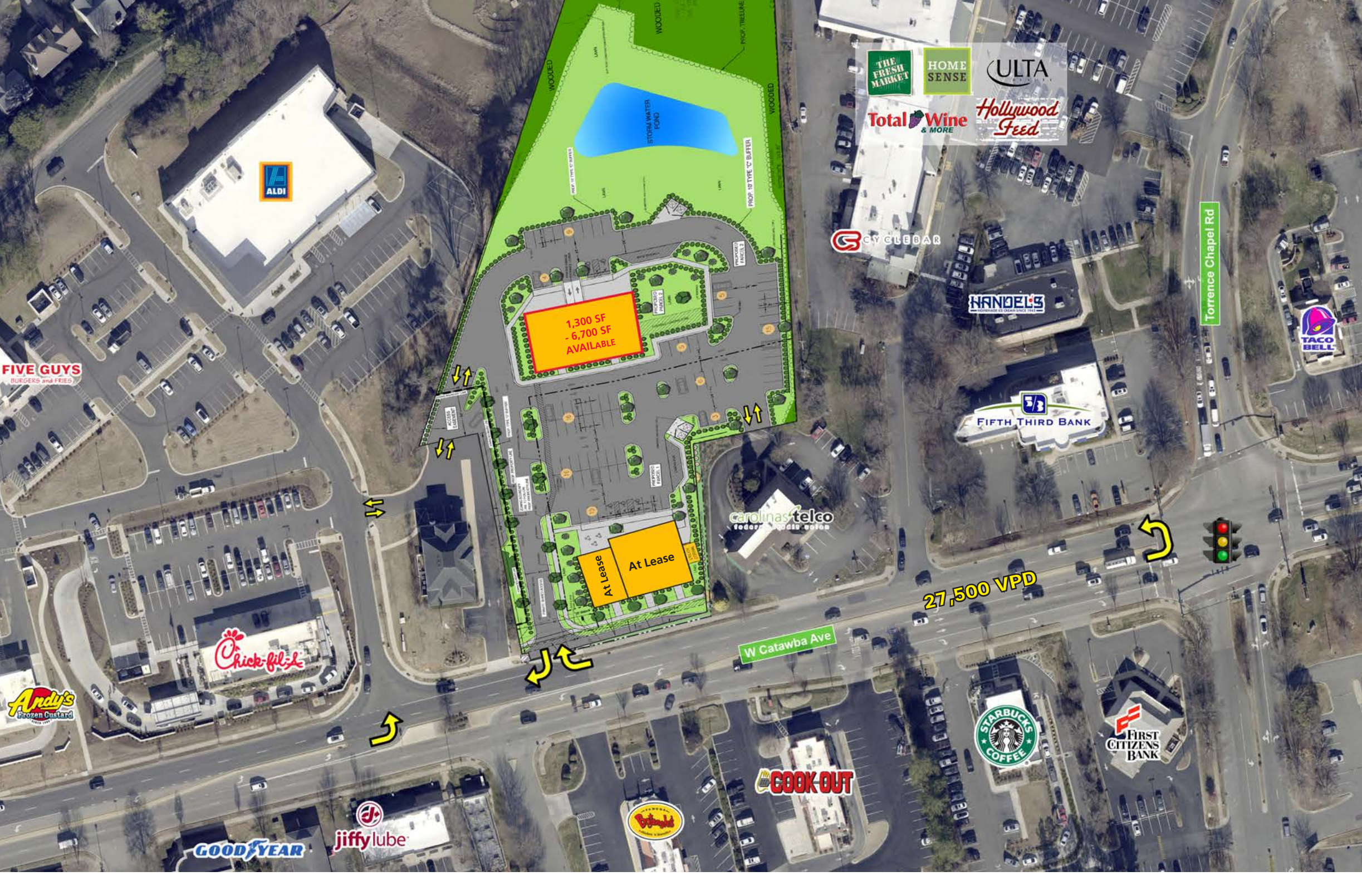
© 2025 The Providence Group. All rights reserved. The information above has been obtained by sources deemed reliable. While we do not doubt its accuracy, we have not verified it and make no guarantee, warranty, or representation of it. It is your responsibility to independently confirm its accuracy and completeness. You and your advisors should conduct a careful, independent investigation of the property to determine to your satisfaction the suitability of the property for your needs.